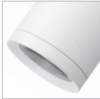
Matte White (62-817)