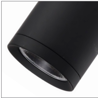
Matte Black (62-816)