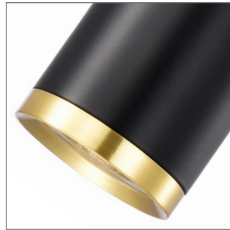
Matte Black/Brushed Brass (62-818)