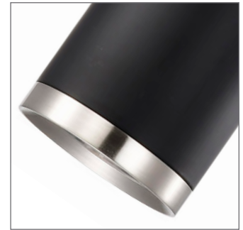
Matte Black/Brushed Nickel (62-819)