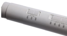
Field Selectable: 3 Wattages and 5 CCT