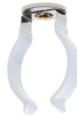
C-Clip attaches to housing to support lamp from the center; magnetic, or add a screw for even more stability