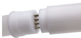
8-Point Contact - Each section has 4 pins and female pin connectors for assured connection