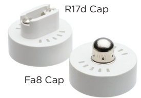
Easily swap Fa8 caps for R17d for applications that require double contact bases

This device complies with Part 15 of the FCC Rules. Operation is subject to the following two conditions: (1) this device may not cause harmful interference, and (2) this device must accept any interference received, including interference that may cause undesired operation.