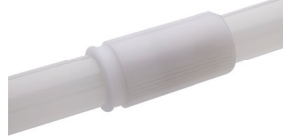
Threaded coupler securely connects both sections of the lamp for continuous illumination