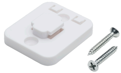
Mounting Bracket and Screws