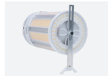
Support Bracket (Not included with S23134)

This device complies with Part 15 of the FCC Rules. Operation is subject to the following two conditions: (1) this device may not cause harmful interference, and (2) this device must accept any interference received, including interference that may cause undesired operation.