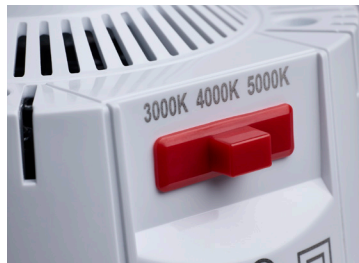
CCT Color Selectable Switch