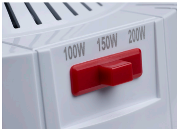
Wattage Selectable Switch